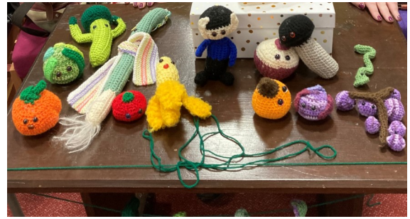
From crocheted fruit and vegetable creatures to handmade Christmas ornaments.