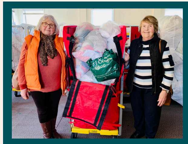
'Smalls for all' charity appeal

For the past 10 years we have run a charity shop, which not only helps with promoting sustainability and the reusing of goods but has created a supportive community all of its own, where church members, members of the community and the lonely regularly visit not only for goods but for a friendly chat and support.