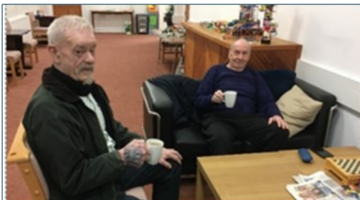
Two of our regular visitors to the Heat Hub, keeping warm, enjoying their coffee, crisps & biscuits, a read of the daily newspapers, having a good blether and putting the world to rights.

Missed your bus – pop in for a while. Need to take the weight off your feet during shopping – pop in. Tea, coffee and biscuits in endless supply as well as the daily newspapers and puzzle books.