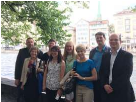
Left: The hosts for the Zwingli Experience.